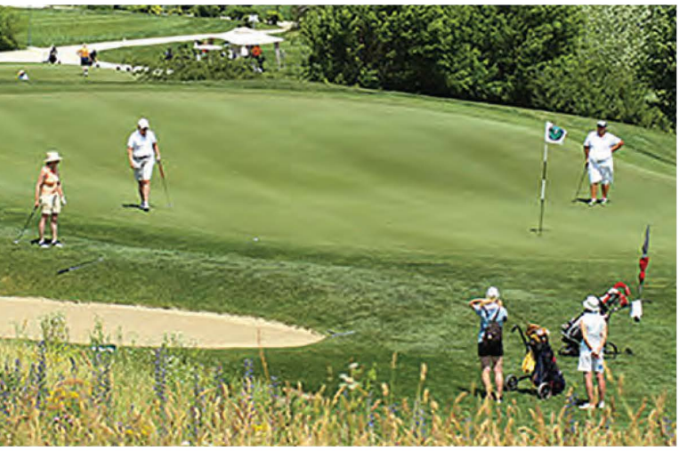
Pannonia Country Club Host of the Hungarian Seniors Open Budapest, Hungary