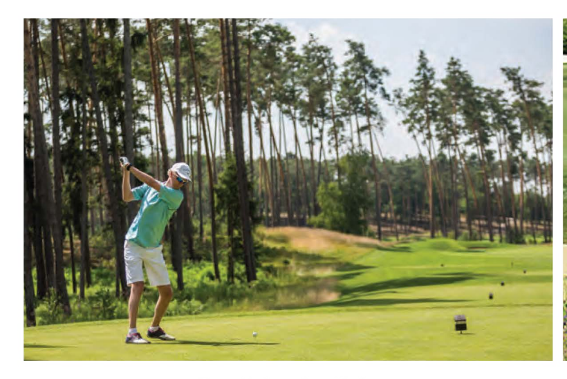
Penati Country Club, Legends Course Host of the Slovakian Open Senica, Slovakia