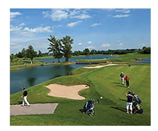
Diamond Country Club, Diamond Course Host of the Lyoness Austrian Open Atzenbrugg, Austria